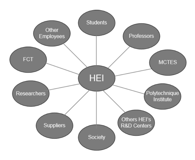
Figure 1 - Diversity of Stakeholders assigned to HEI under study

Se ao nível do aspecto organizacional, e tomando como exemplo esta HEI, quiser-se fazer uma correspondência entre as diferentes áreas funcionais e os stakeholders associados, verifica-se que existe uma diversidade de stakeholders com diferentes perceções e requisitos de qualidade, que variam de acordo com a área funcional a que dizem respeito ( Fig. 2 ).