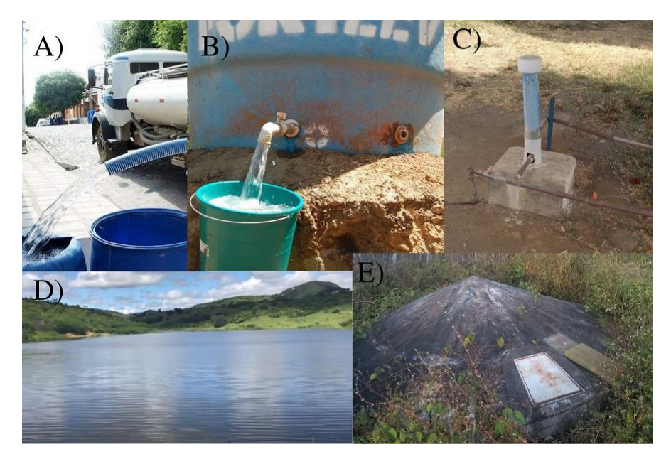
Figure 2 - Images referring to the strategies taken in the city of Doutor Severiano- RN

In the city of Doutor Severiano, several strategies have been developed over the years to adapt to the periods of greatest water crises due to the semiarid climate of the region. Among these strategies are the use of weirs to supply the entire municipal population, well drilling and use of groundwater, and construction of plate cisterns, or use of "plastic" cisterns to capture rainwater and supply by water tank trucks that transport water from other cities to Doutor Severiano. These alternatives can be seen in Figure 2, which contains five images referring to the types of strategies taken in the municipality.