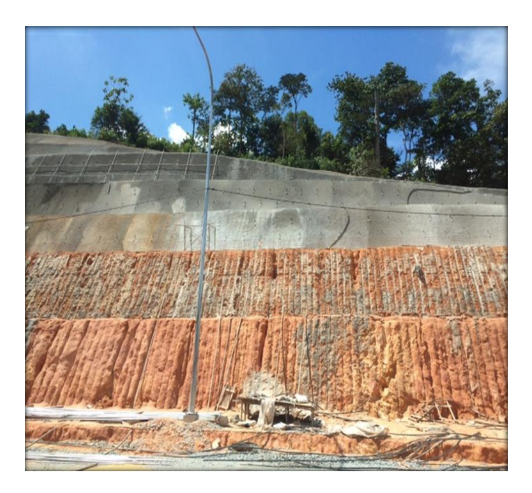
Figure 2. Engineering slope-cut and filling 29 Nov 2015 at NKVE

slope geometry management and its procedures (Figure. 2) illustrates a useful engineering practice of slope-cut and filling at Kuala Lumpur NKVE highway side.